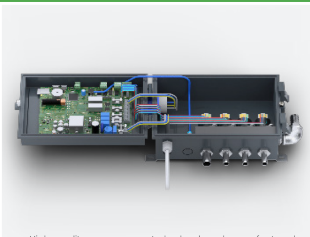
High-quality easy...con control – developed, manufactured and tested in Germany.